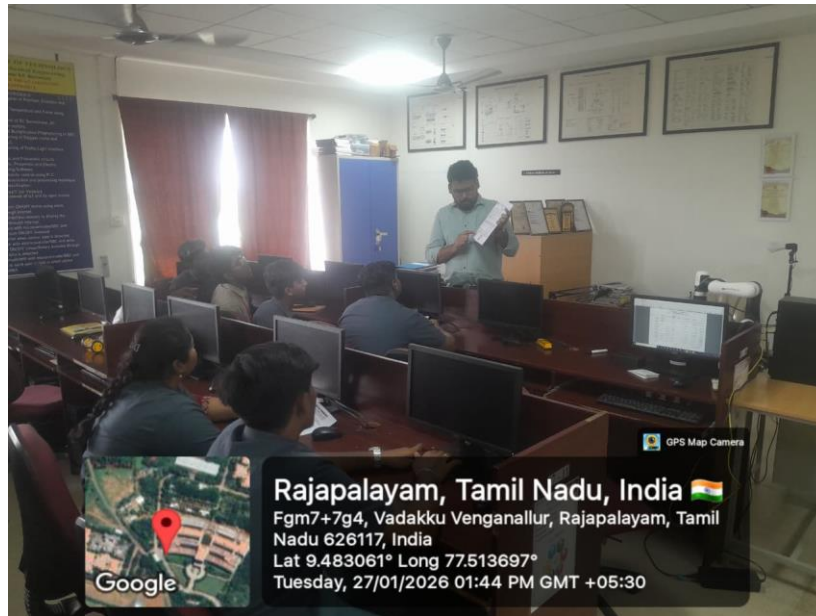
Fig. 1 Poster

(Activity reports not supported by photographs shall not be considered for award )