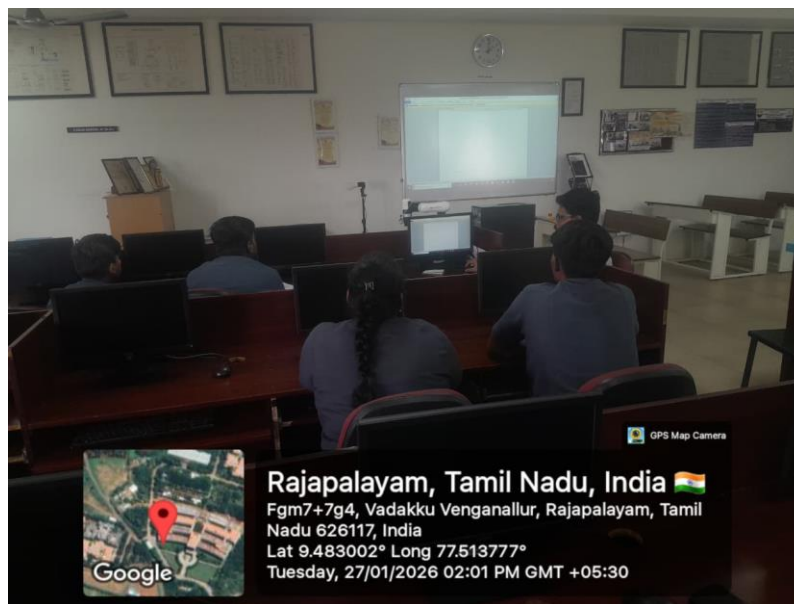
Fig. 2 Glimpses